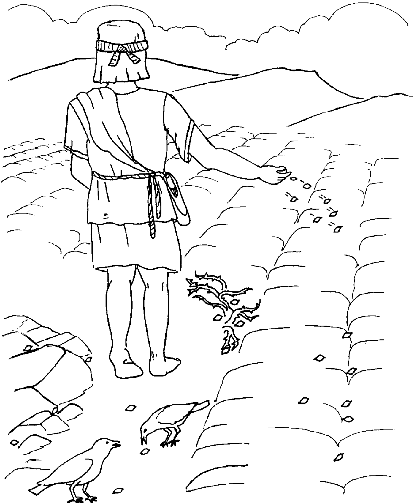
Jesus told the parable of a sower who went out to sow his seed. LUKE 8:4-18