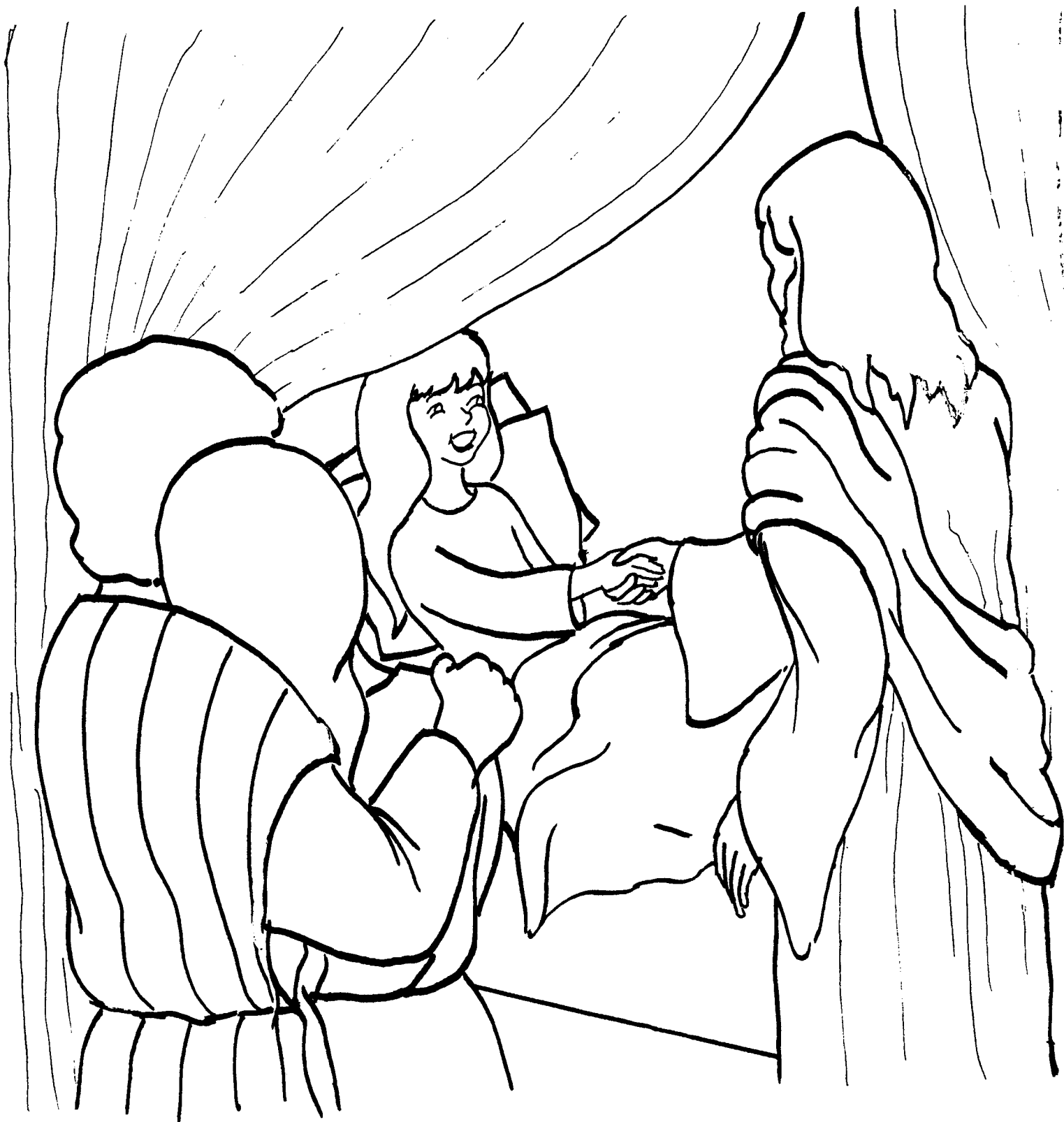
"Jesus raises the daughter of Jairus." Luke 8:40-56